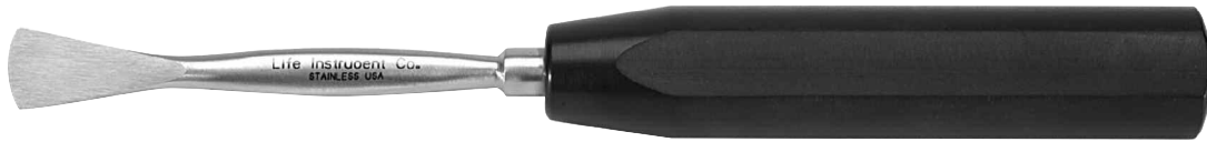
LANGENBECK ELEVATOR 9" overall length 230mm